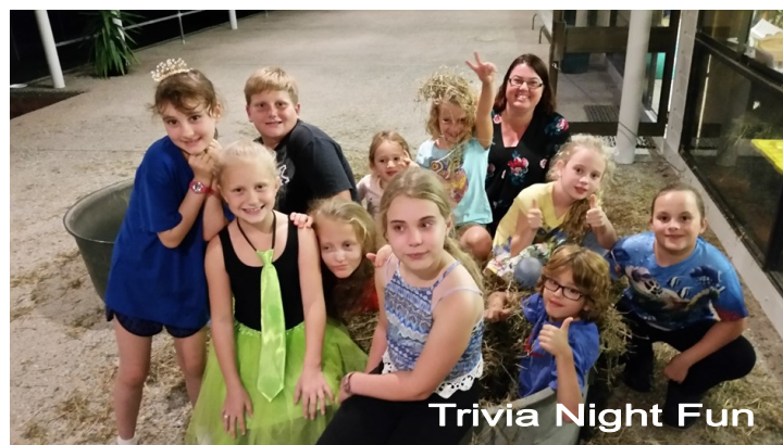
Trivia Night Fun