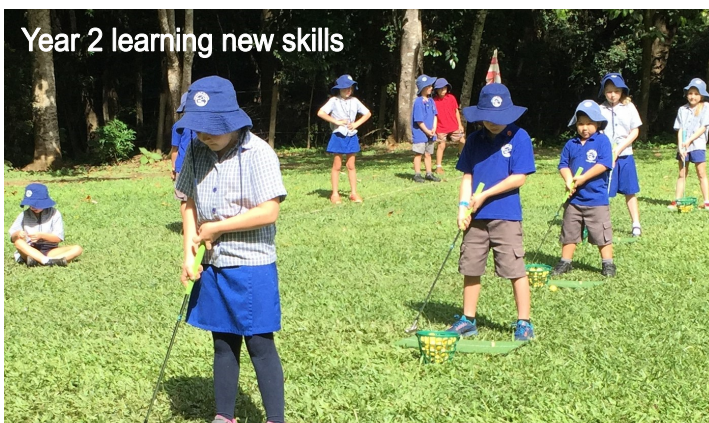
Year 2 learning new skills