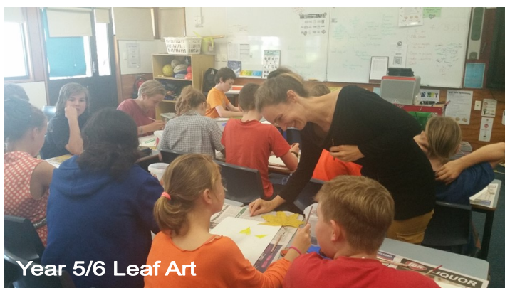
Year 5/6 Leaf Art