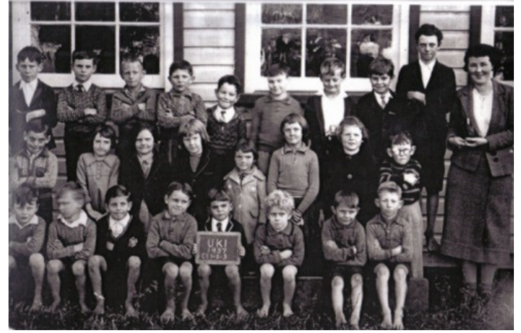
hear from you. Uki School, 1937

The committee organising the celebrations for the 125 year anniversary of the school is already hard at work. The celebrations will take place on the long weekend of June 6 - 8 2020, so save the date, and let any friends and family members know as well. Our next meeting will be on Monday 12 November in the school staffroom, and we'd love to see as many people as possible contributing ideas to this wonderful and very special celebration.