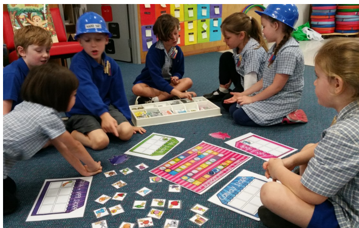
Year 1 are learning about money by playing a shop game